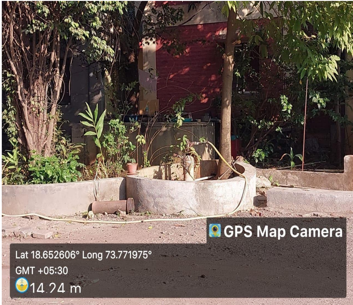
Bore well/ Open Well Recharge