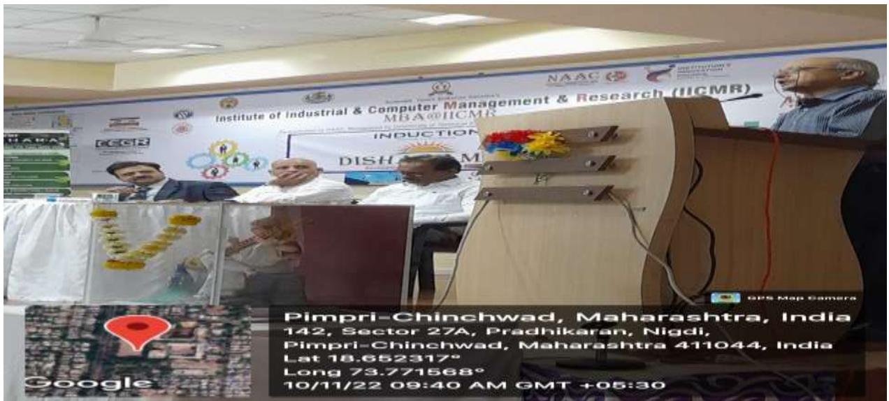
Guest addressing the students