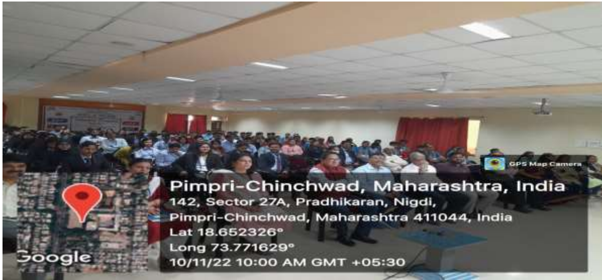
Guest addressing the students