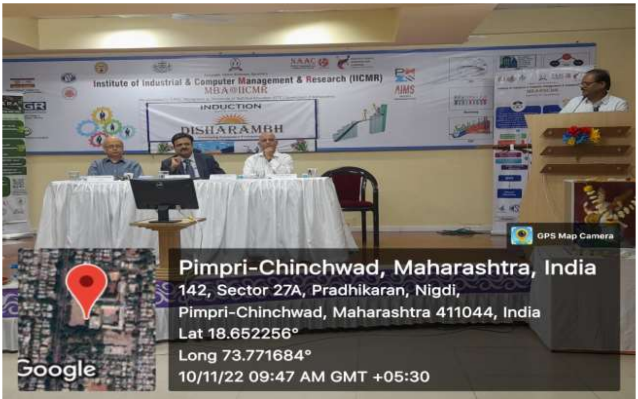
Guest addressing the student