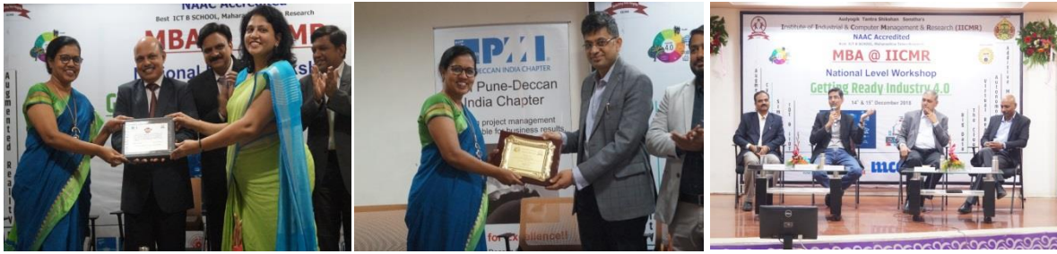
Glimpses of National Workshop 2018